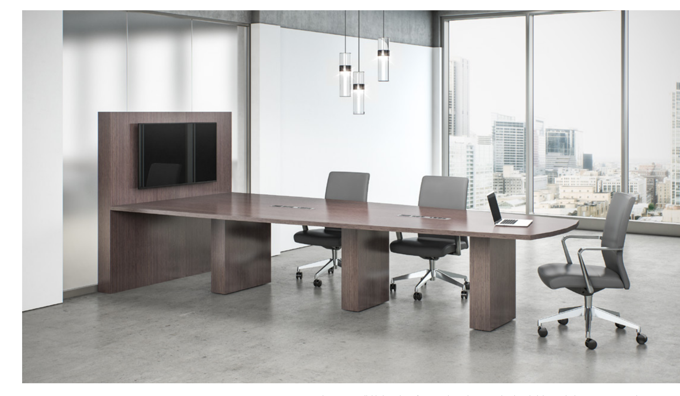
HPL or LPL bases are available in variety of rectangular and square cube sizes, heights, and wire management options.

environment. Carrying case, 15 amp power cord and HDMI cables included. Symphony also offers shared media storage solutions such as our four door cabinet with shared media wall. Lastra rounded media table with allowing any space to become a shared media shared media wall (right page).