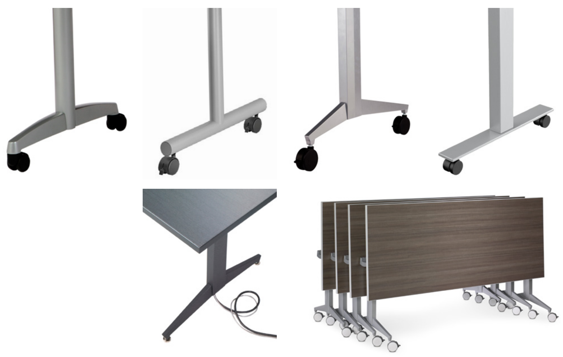
Capri, Moto, Ria and Zoey are available in T or C (offset T) fixed or flip versions on adjustable glides or casters. Vertical wire management and adjustable height options available as well.