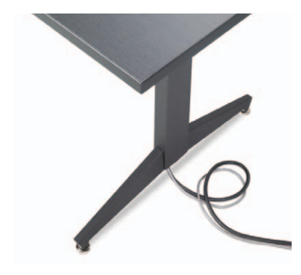
Integrated vertical and horizontal wire management