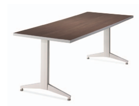
15", 21", 27", and 33" C and T base versions with fixed or flip tops at lounge, standard/dining, custom, or adjustable height on glides or casters for 18" –42" deep tables