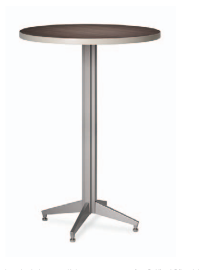
21", 27", and 33" X base versions with fixed or flip tops at lounge, standard/dining, or bar height on glides or casters for 24"-42" tables